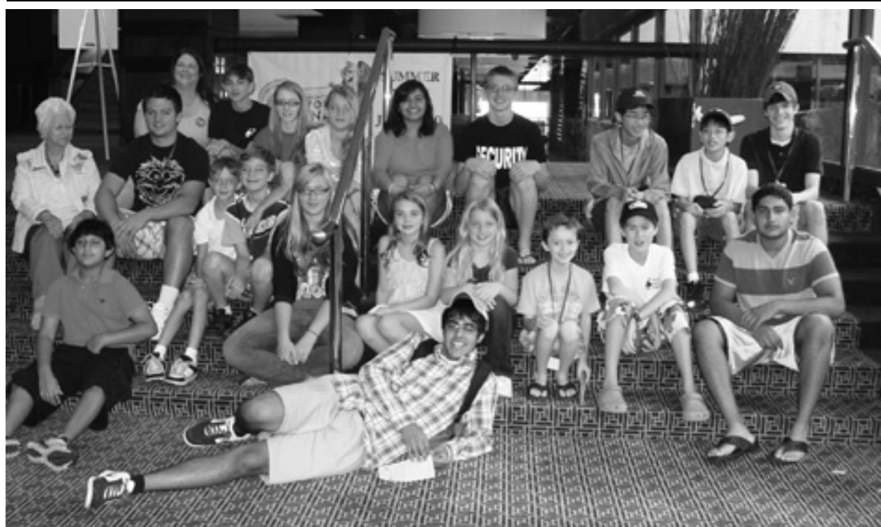
Atlanta Junior Bridge has had a huge presence at each of the four Youth NABCs, the first being held in the Atlanta area in 2008. Here are some of the Atlanta contingent in Toronto.

See you at the 2012 Youth NABC, July 19, 20 and 21 in Philadelphia. Don't miss it!